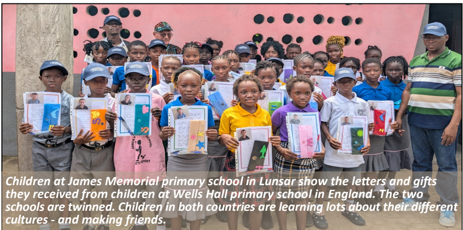
Children at James Memorial primary school in Lunsar show the letters and gifts they received from children at Wells Hall primary school in England. The two schools are twinned. Children in both countries are learning lots about their different cultures - and making friends.

These donations mount up. £468 sponsors another child at school or pays for two wheelchairs. So we would really appreciate it if you could take a moment to sign up and support us. It's completely free. You can find our Easyfundraising page by scanning the QR code above.