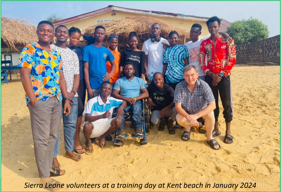
Sierra Leone volunteers at a training day at Kent beach in January 2024

In addition to Committee members our other volunteers are: