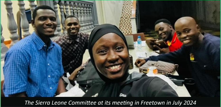
The Sierra Leone Committee at its meeting in Freetown in July 2024